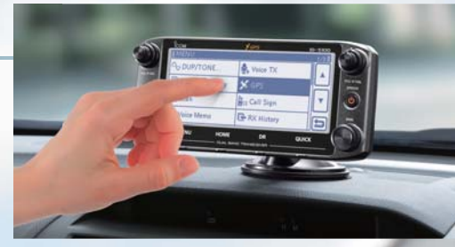
Vehicle installation example (Using optional MBF-1 mount base and MBA-2 controller bracket)