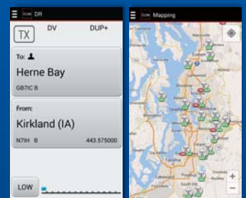
DR function setting example

* Optional UT-133/A Bluetooth® unit must be installed in the ID-5100A Some functions may not work properly, depending on Android™ phones and devices used.