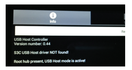
USB Host Controller App Compatible Device 1