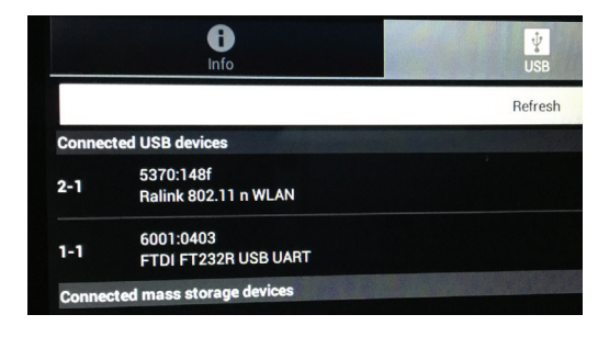
USB Host Controller App Compatible Device 2